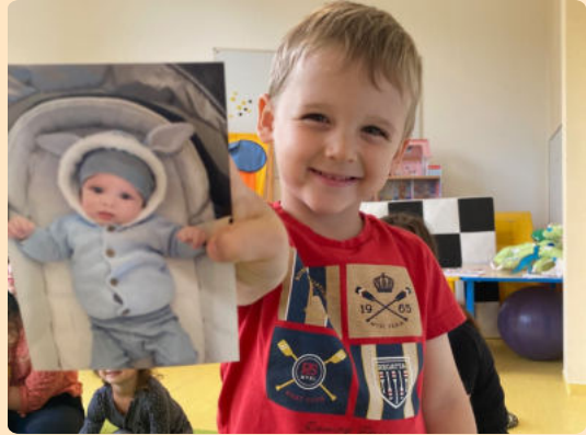
more from "This is me" projects...