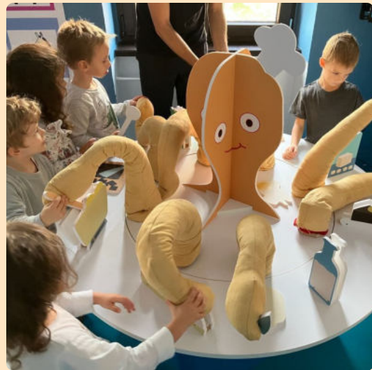
Some of us visited Multium gallery focusing on optic illusions.